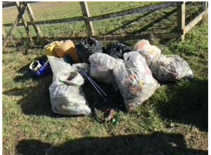
February Litter Pick ‘Haul’ from Redbourn to Cherry Tree Lane