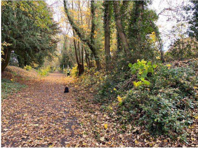
Cutting Back Vegetation at Hunters Oak in November