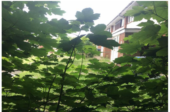
Thumpers Possible Level Access Point