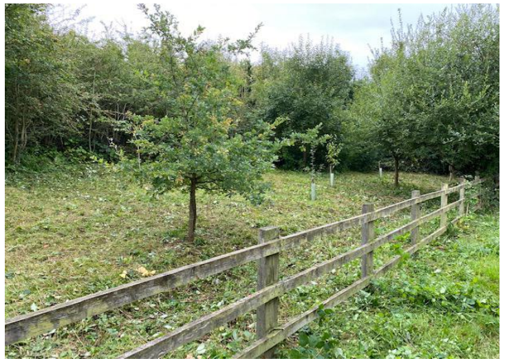
Orchard After the Annual Cut in September