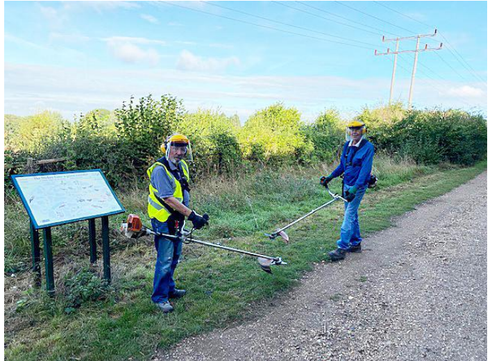
Brush Cutting by Knott Wood in September