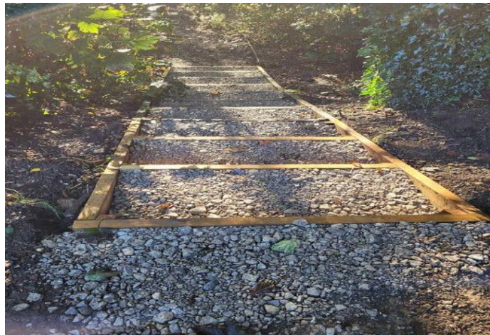
Thumpers Access Steps Repaired in October

the edge of Yew Tree Wood. Friends have identified a level access possibility from Thumpers with an apparently modest price tag and with disabled parking nearby. This would provide a much improved access to the Line for local residents, disabled users, parents with young children etc. CMS have agreed our suggestion as attractive and are to seek costing and funding.