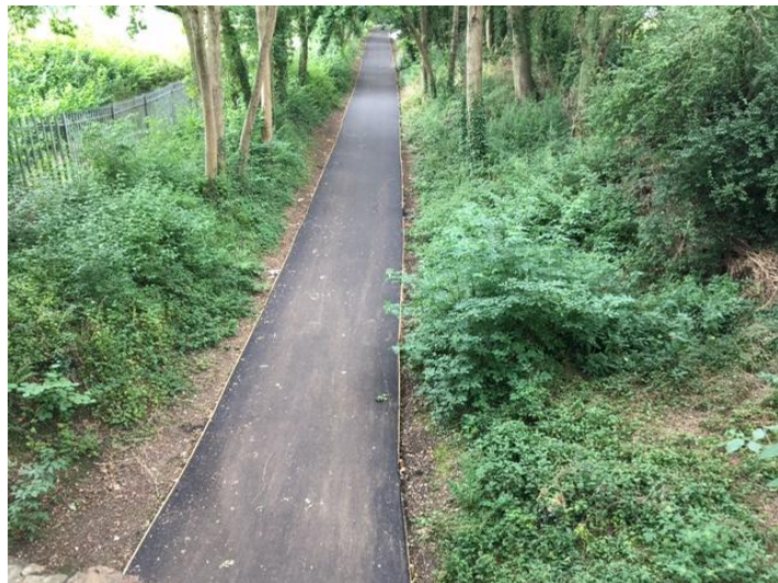
The New Tarmac Surface Near Hunters Oak

The nature of the Black Tarmac has generated mixed feedback from users and fuelled the debate about the type of surface we want for other sections of the Line as discussed above.