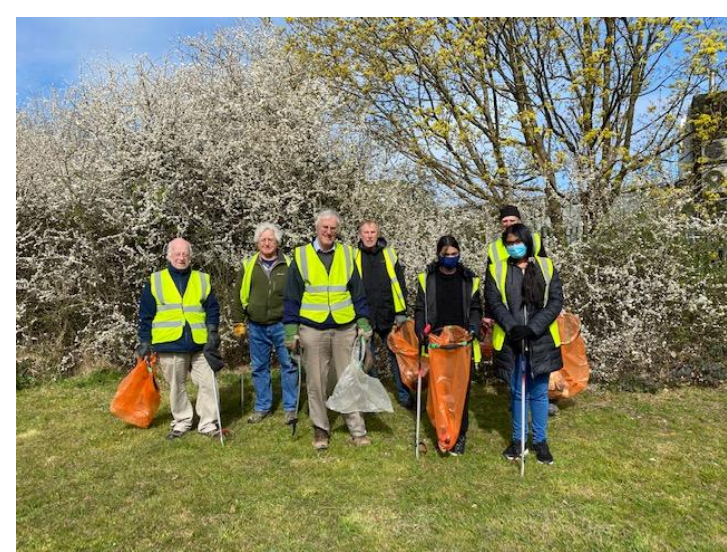
Dacorum Litter Pick Team in April

** Contact Geoff at geoffbunce.t21@btinternet.com or 07903 476584 to be added to our volunteer working party email notifications. Watch the website for details of future planned work **