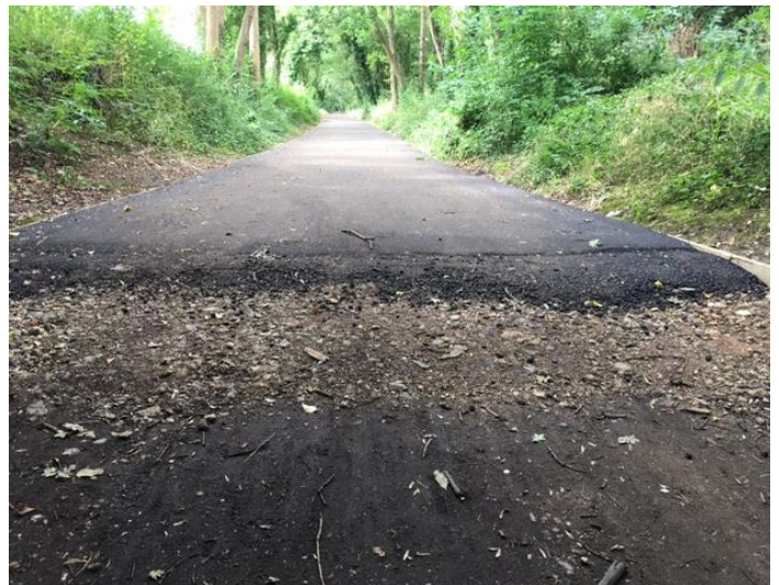
The End of the Tarmac at Cherry Tree Lane