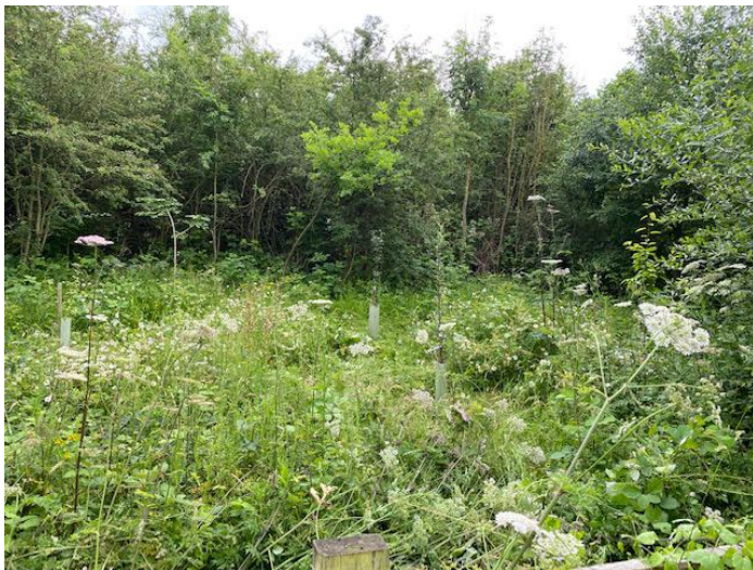
Redbourn Orchard with Flowers in July