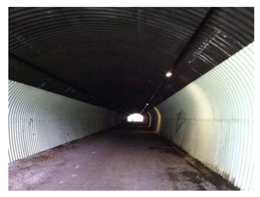
The M1 Tunnel Finally Gets New Lights

Following agreement between St Albans District Council, Redbourn Parish Council and the Highways Agency, the old (and much vandalised) lights have now been replaced with a reduced number of more vandal resistant ones.